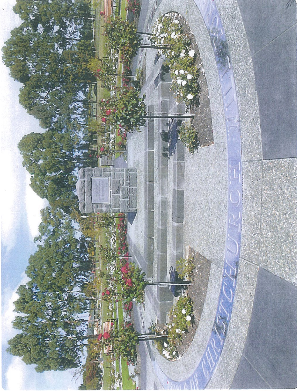
Avonhead Park Cemetery