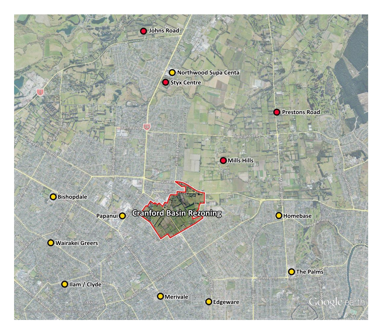
Figure 1: Existing and Proposed Centre Network

Retail expenditure generated in Cranford Basin would be spread among all the identified centres (among others as well e.g. Riccarton) to various levels depending on the consumers purpose of trip, but nonetheless they would all remove retail expenditure available for any future localised retail offer in the rezoned area.