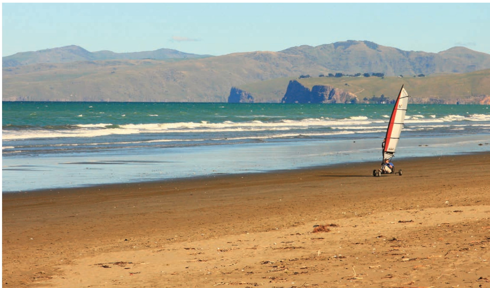
Title: 'Land sailing on Waimairi beach' Location: Waimairi beach, Christchurch