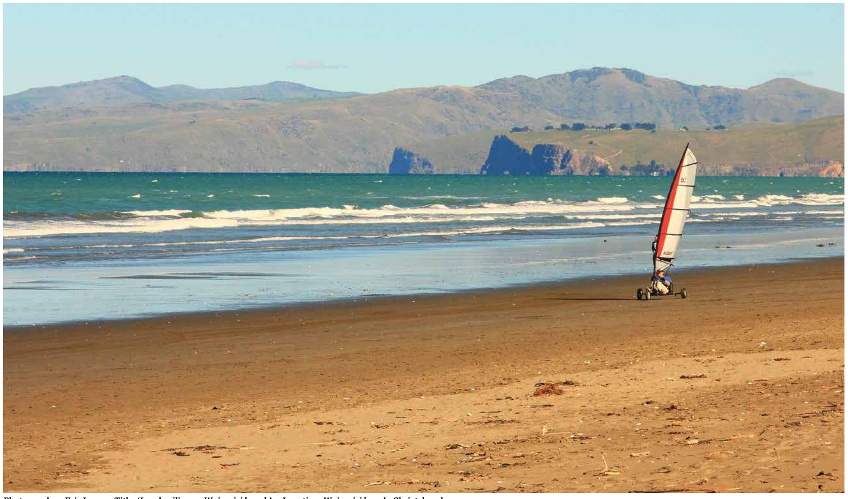
Title: 'Land sailing on Waimairi beach' Location: Waimairi beach, Christchurch