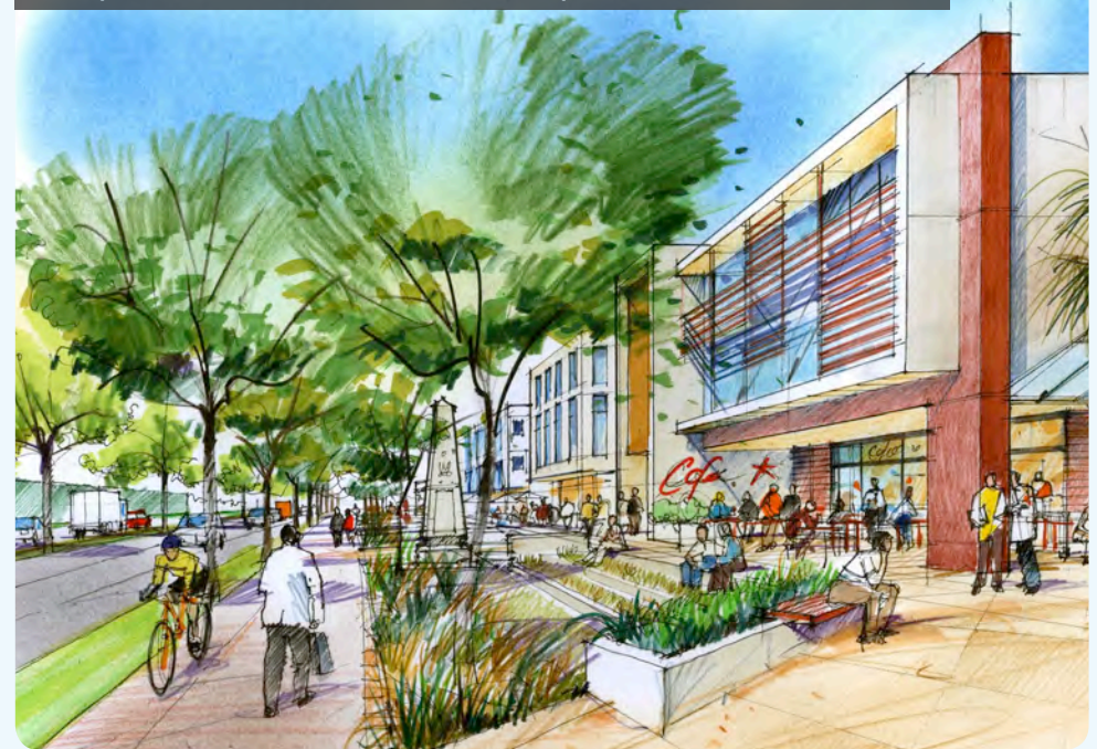
Cross-section of the proposed Memorial Avenue edge highlighting the space available for an integrated war memorial