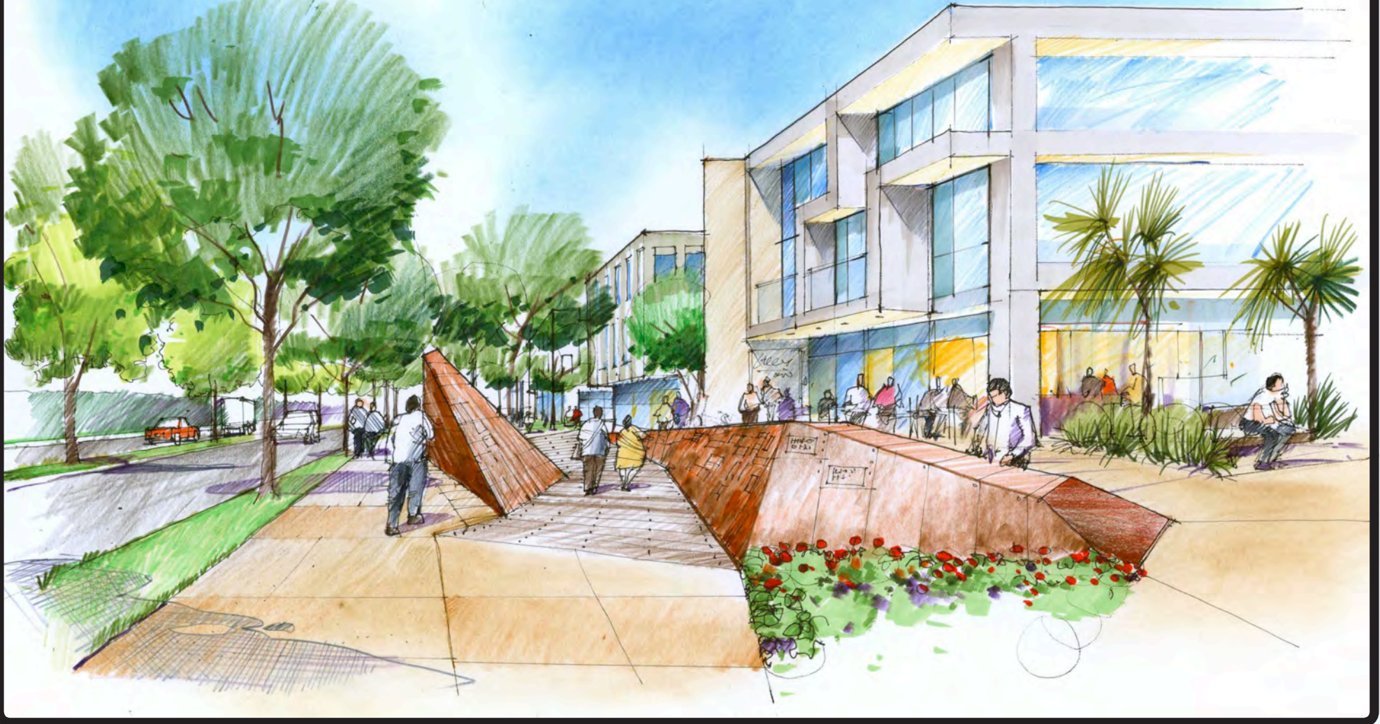
Artist impressions of possible memorial feature at MBP site

The concept suggests that there are individual war memorials representing each conflict sited in the linear park potentially in chronological order. An important aspect of the design is how the memorial sculpture and the landscape integrate creating everyday spaces that will be enjoyed and remembered by generations to come.