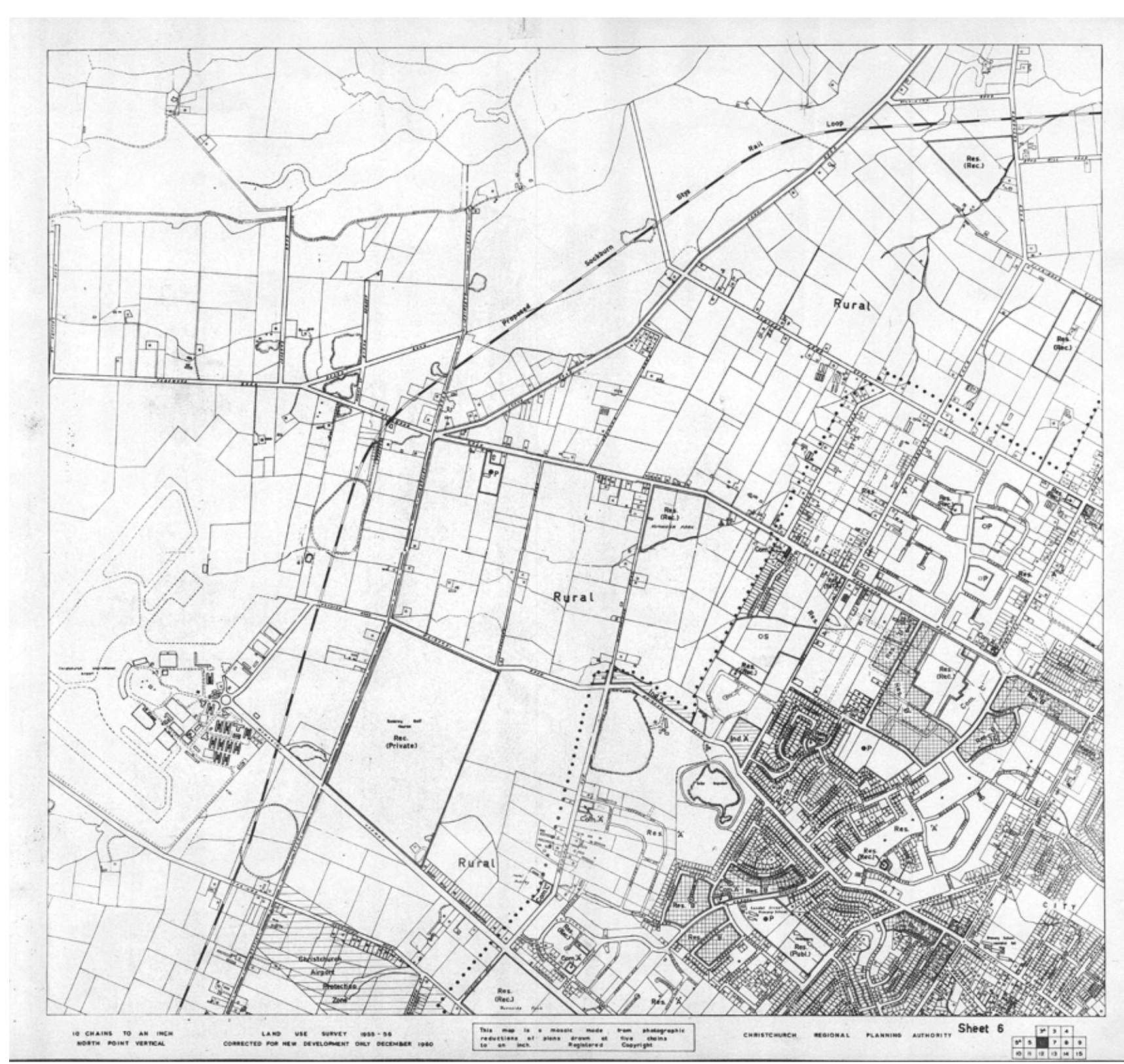
1965 Operative Waimairi County District Scheme