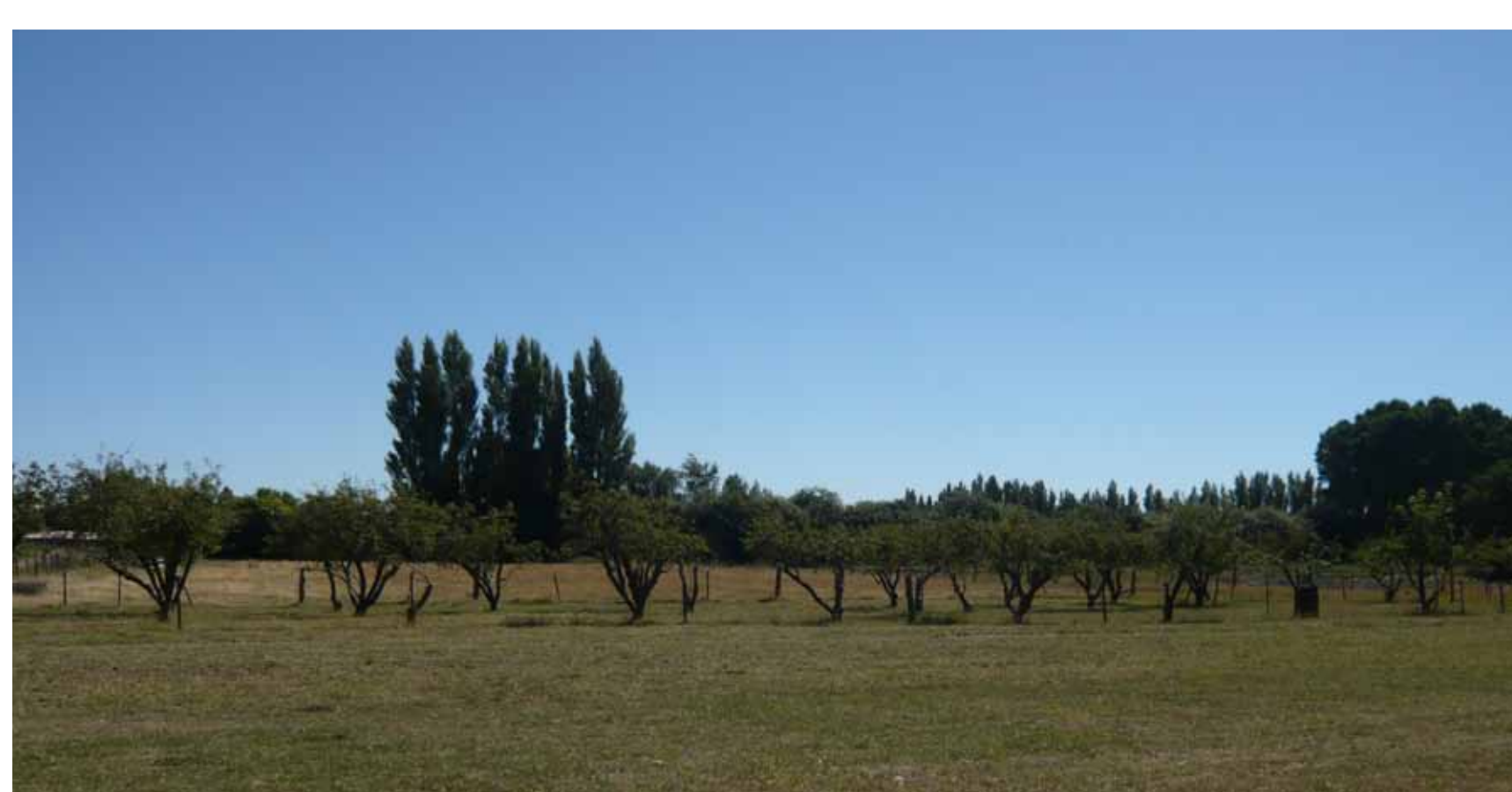
Area two, looking north from near Wairakei Road

The small land parcels have been one of a number of factors that has made it increasingly difficult to farm or use the land for horticultural activities.