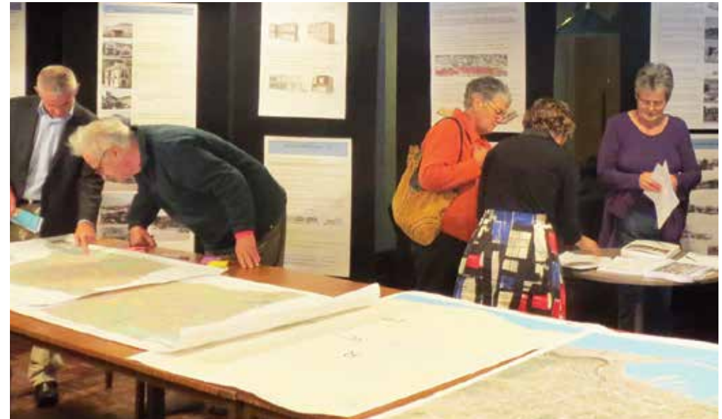
Residents in Lyttelton offer their views on how Christchurch looks and operates in the future.