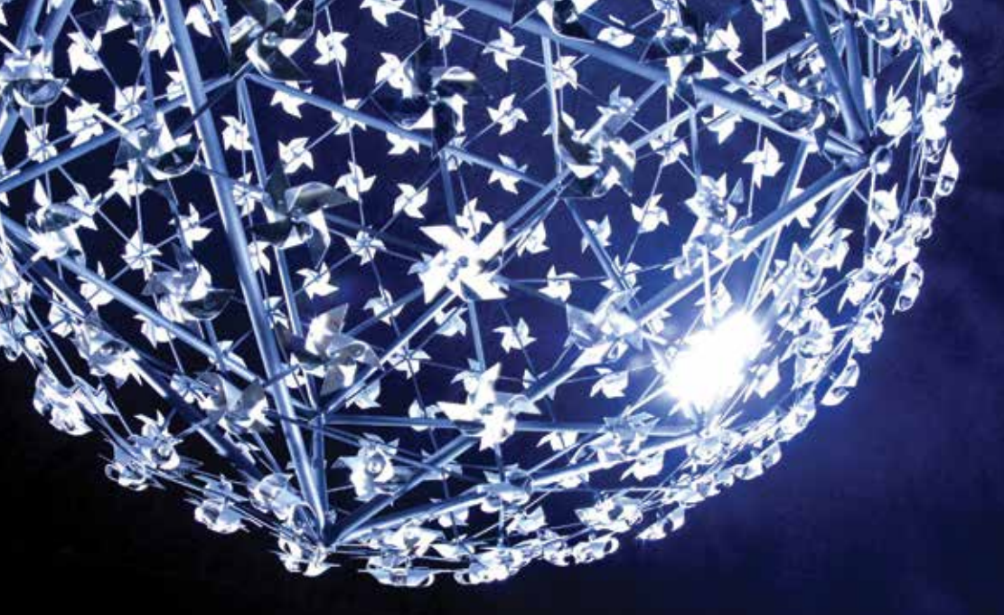
The spectacular sculpture Fanfare is a step closer to finding a permanent home at Chaney's Corner.