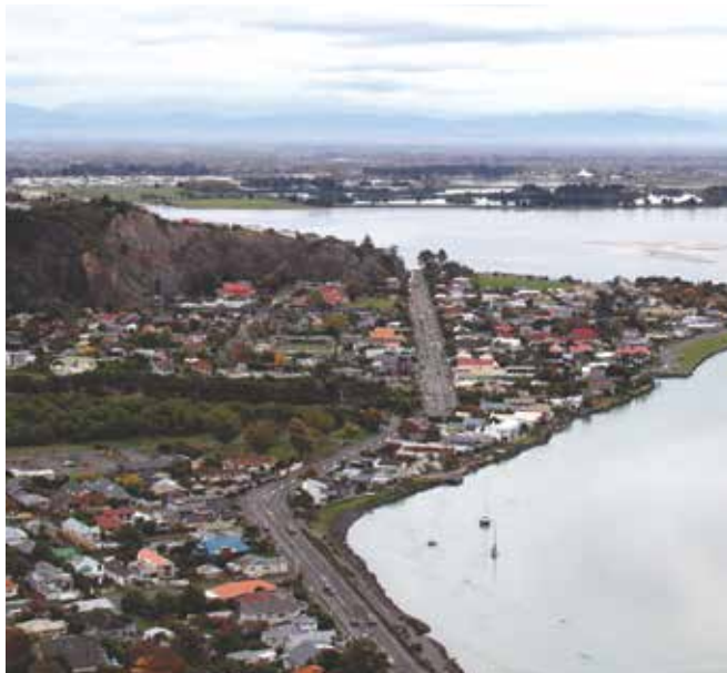
The Draft Main Road Master Plan will support the recovery for communities between Ferrymead Bridge and Marriner Street, Sumner.

The Draft New Brighton Centre Master Plan awaits decisions on the possible provision of aquatic facilities within the New Brighton Centre.