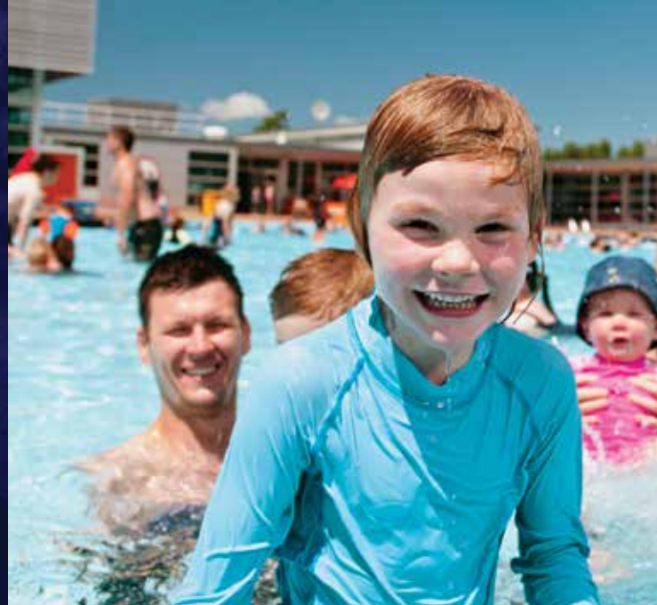
Visits to Jellie Park have soared 35 per cent since the earthquakes closed other city facilities.