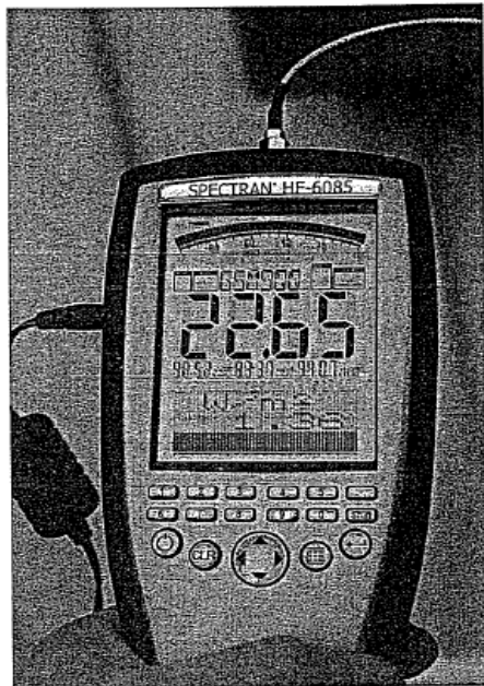
Left: A spectrum analyser can measure the strength of signals emitted by smart meters

Bill's meter is a type that measures the total peak reading but not the frequency