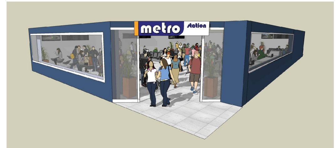
Proposed Riccarton passenger waiting lounge - concept drawing only

This proposal replaces our earlier investigations into a site outside Westfield Riccarton Shopping Centre as we had difficulty getting a suitable space there and we had concerns about pedestrian safety.